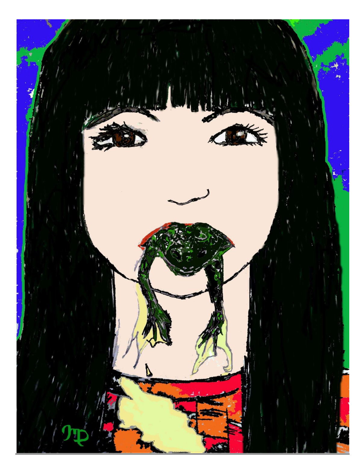
© <u>Miki Dare 2014</u> Free to use for nonprofit educational purposes only.