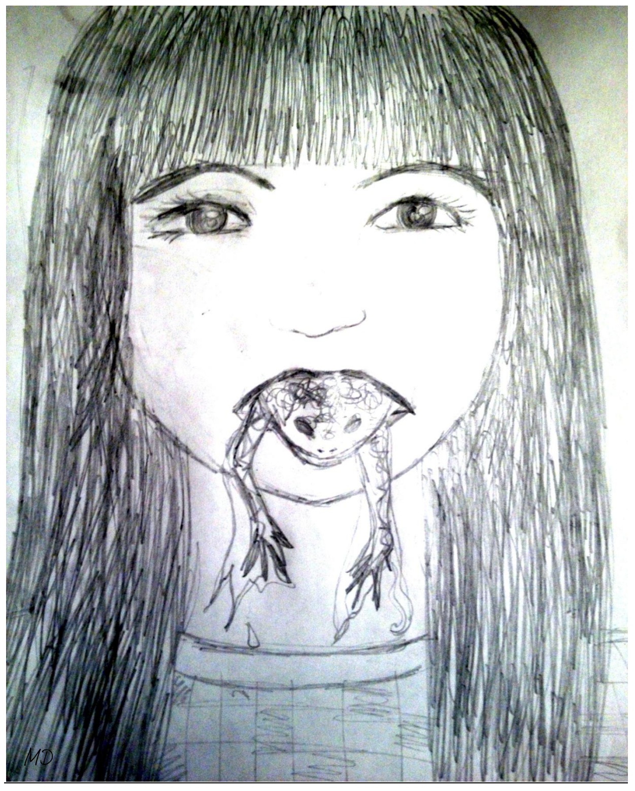
© <u>Miki Dare 2014</u> Free to use for nonprofit educational purposes only.